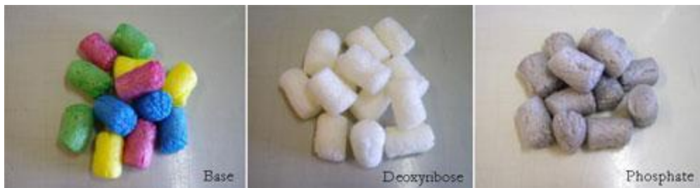
Fig. 2 - From left to right, the flakes representing the bases (red, blue, green and yellow), the phosphate groups (grey) and the deoxyriboses (white).

In Sanger sequencing method, the four bases are detected using different fluorescent labels and are represented as peaks of various colours which can then be interpreted to determine the base sequence (Fig. 3). Normally the G curve should be drawn in yellow but as this colour is not easily readable, it is here represented in black.