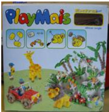
Fig. 1 - A box of Playmais contains more than 500 flakes. It may be ordered on the official website www.playmais.com or bought in common supermarkets as the brand is widely distributed in many countries.

In order to construct a long DNA molecule with children or students, we were looking for various supports. We found that the most suitable one consists of Playmais flakes. A box of Playmais (Fig. 1) contains hundreds of little colourful flakes made from cornstarch, thus recyclable and safe for the environment. Despite its playful appearance, this support is attractive in many ways. It is safe for children, very easy to use (a humid sponge is enough), light, malleable and easy to obtain. Because it does not take long to build a DNA molecule with this model, the teachers will therefore have time to explain more precisely the concept of it before the pupils begin the construction.