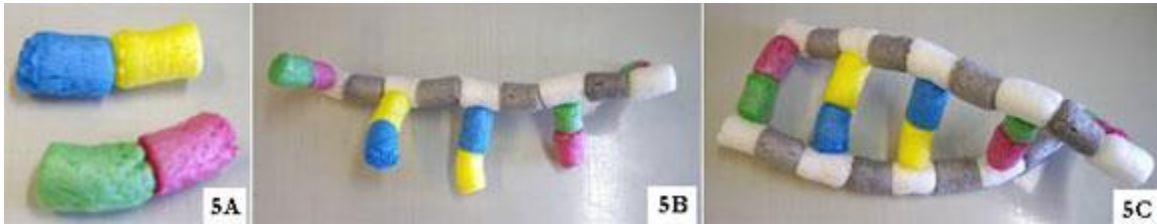
Fig. 5 - Base-pairing and assembly of the whole DNA structure. (5A) Base-pairing of an A with a T on one hand and of a C with a G on the other hand. (5B) Adjunction of the base pairs as a spiral to the deoxyriboses of a side chain. (5C) Assembly of the second side chain to the rest of the structure.

The second step is to pair the bases together, that is to say stick an A with a T on one hand and assemble a C with a G on the other hand (Fig. 5A). Once the base-pairing is done, the pairs will be added to the deoxyriboses of a side chain one after the other so that it makes a spiral around the chain (Fig. 5B). In order to respect the real DNA structure, ten base pairs will be added per turn of the double helix.