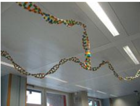
Fig. 6 - Example of a 30m long DNA molecule built by children during the 450 th birthday of the University of Geneva. For further pictures of this successful event, please check out the following link: http://medweb2.unige.ch/bioutils/archives2009.php .

In the end, you obtain a DNA molecule which can be as long as you want (Fig. 6). This figure is a picture taken on the 13 th of June 2009 for the 450 th birthday of the University of Geneva in Switzerland. A stand called “Build the DNA molecule” addressed to children from 8 to 12 years old was spearheaded by BiOutils ( www.bioutils.ch ), a platform which provides material for modern biology experiments in schools.